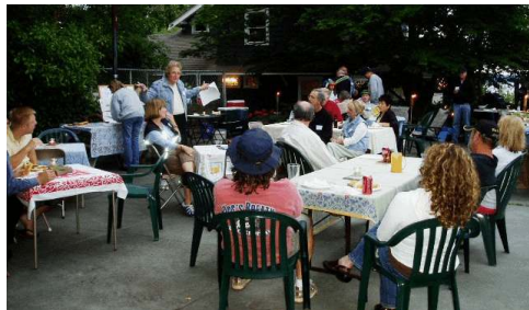
9600 Block 47 th Ave SW