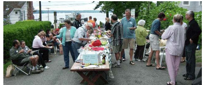
4500 Block SW Henderson