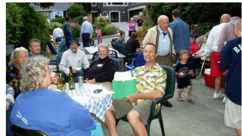
9200 Block 46 th Ave SW