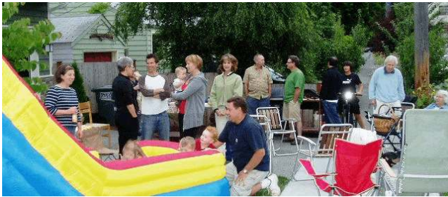
9200 Block 47 th Ave SW

held parties every year since the Night Out program began. They even have a banner. They are proud to proclaim they have had an organized Block Watch program for 16 years and, in keeping with the theme of Neighborhood Night Out, they hold disaster preparedness meetings and instruction every year as a regular part of their festivities.