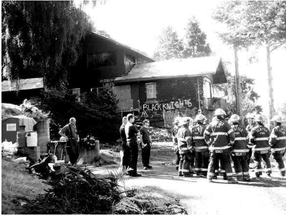
Briefing the Recruits

In July, the Seattle Fire Department went door to door on 47 th Ave SW to advise the neighborhood of fire activity during the latter part of July. SFD was going to hold training exercises for their new recruits. The owners