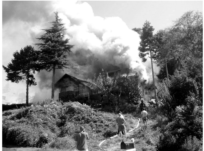
The Training Exercise

of the run down house in the 10000 block of 47 th Ave SW offered their house to SFD so it could be set ablaze to help train recruits. It was quite a spectacle. Neighbors on 47 th Ave SW, family and friends of the recruits and the construction workers on the new house next door turned out to watch. Several ferry passengers arriving from Vashon or Southworth saw and reported the fire south of the Ferry Dock only to find out it was a training exercise. The recruits passed their test and contained the fire.