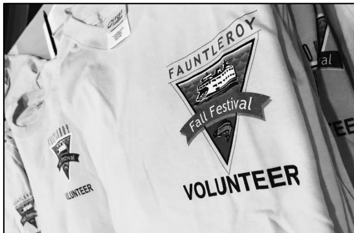
To sport one of these t-shirts during the festival, call 206-932-5600 or stop by the Fauntleroy Church office to pick your volunteer assignment.